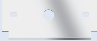
Silvers Skin Graft Blade (for use with Silvers handle)