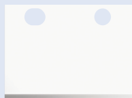
1 Segment Dermatome Blade