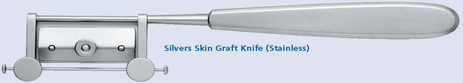
Sivers Skin Graft Knife (Stainless)