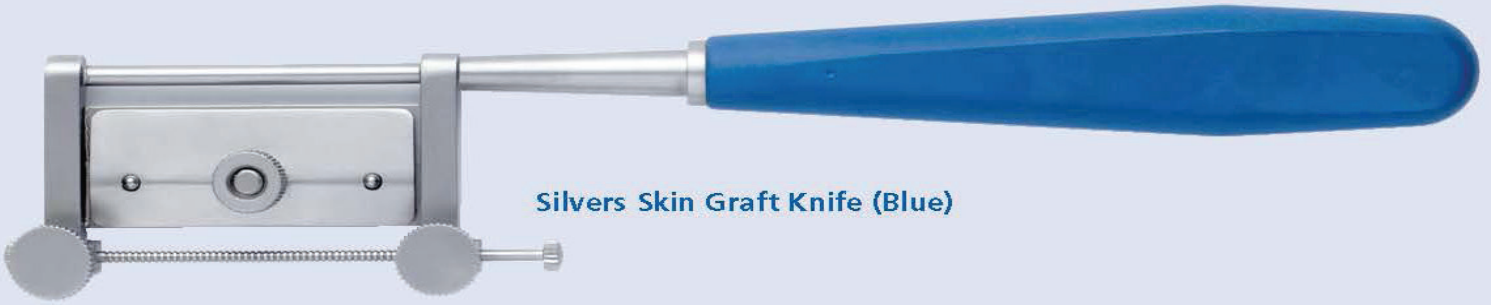
Sivers Skin Graft Knife (Blue)