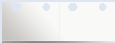
2 Segmental Dermatome Blade